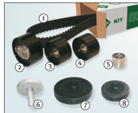
Image 2: Contents of kit 530 0342 10

Appropriate spare parts can be found in our on-line catalogue at www.Schaeffler-Aftermarket.com or in RepXpert at www.RepXpert.com .